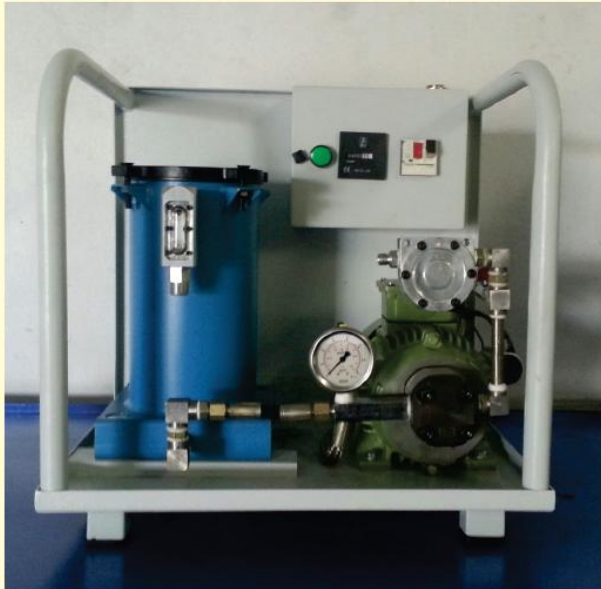
MODEL : HF - 40 SKID