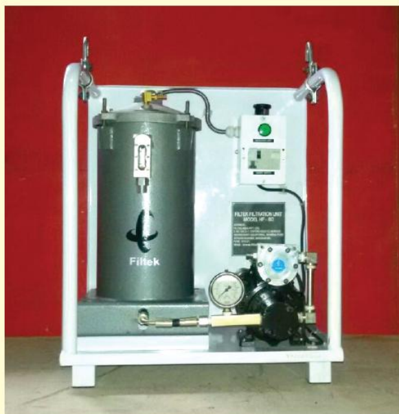
MODEL : HF - 60 SKID

FILTEK HF Series Filtration Skids are efficient in keeping the oil within the engine/equipment continually clean. Removal of ferrous particles and traces of water / moisture is an added feature.