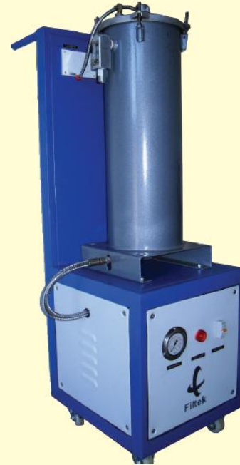
MODEL : HF - 240 SKID

HOW IT WORKS : The contaminated oil enters a magnetic conditioner to remove ferrous particles. The oil is pumped through a metering jet to the tightly compressed cellulose fibre filter element, where all solids down to 1 micron and below are captured, while neutralizing acids and sulphur compounds. The filtered oil then enters the heated evaporation chamber, where water particles are evaporated and vented out. The clean oil is then gravity fed back to the tank.